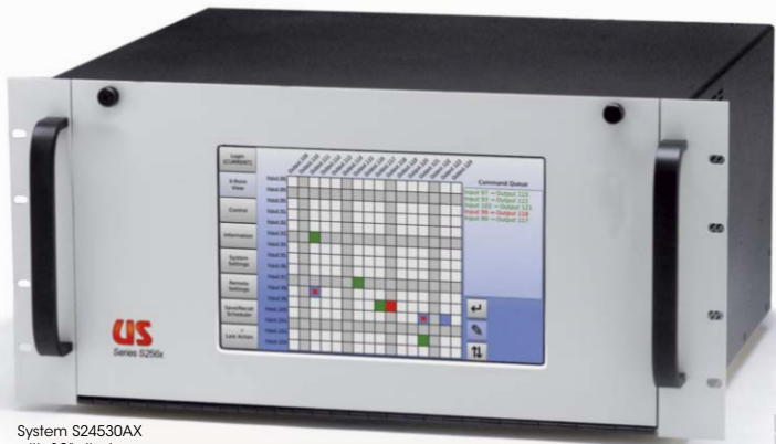
System S24530AX with 10" display