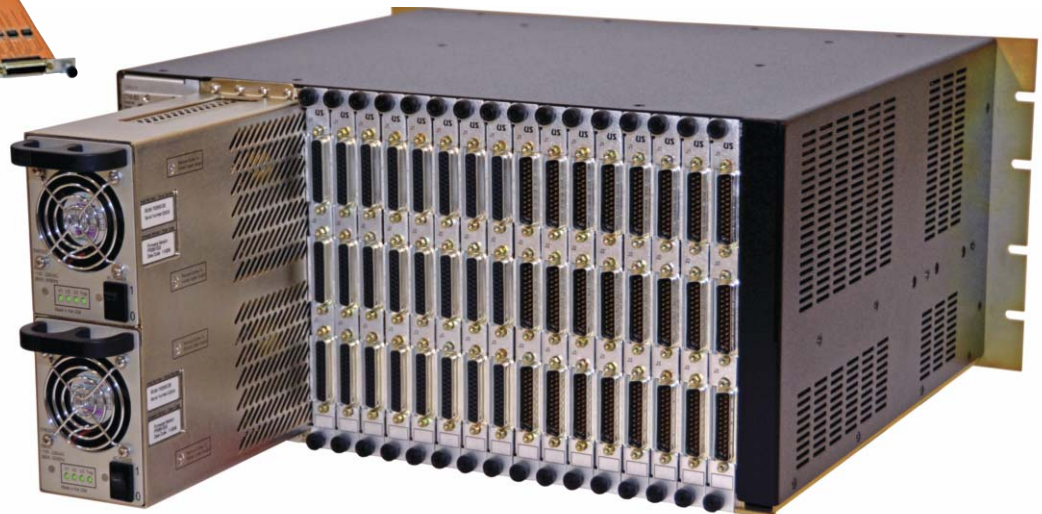
Up to eight DCE and DTE modules install at the rear