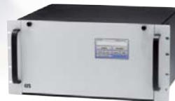
System S24530A with 4.3" display